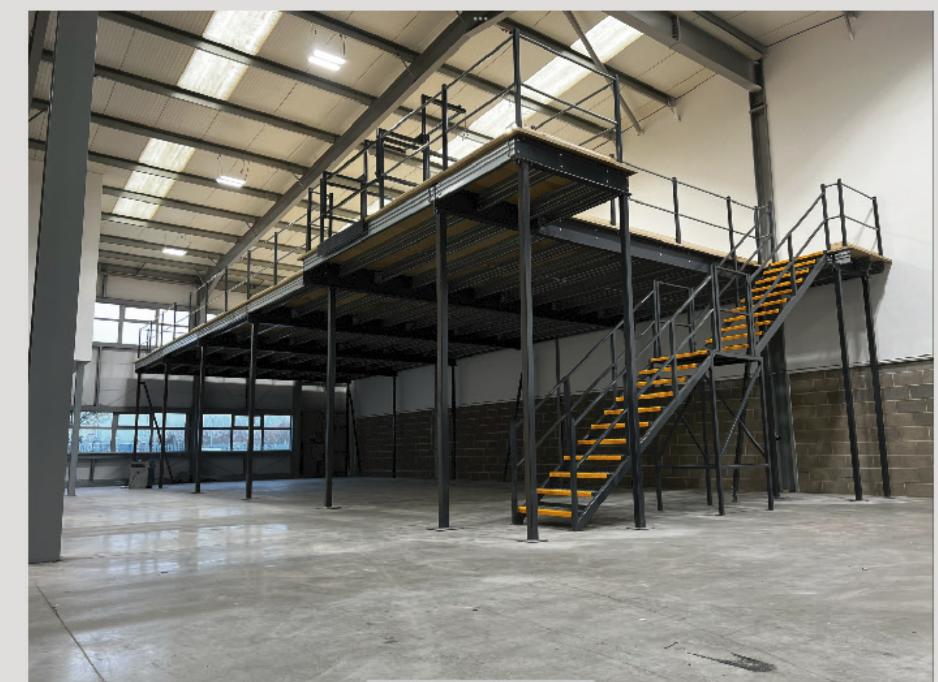
Completion & Hand over