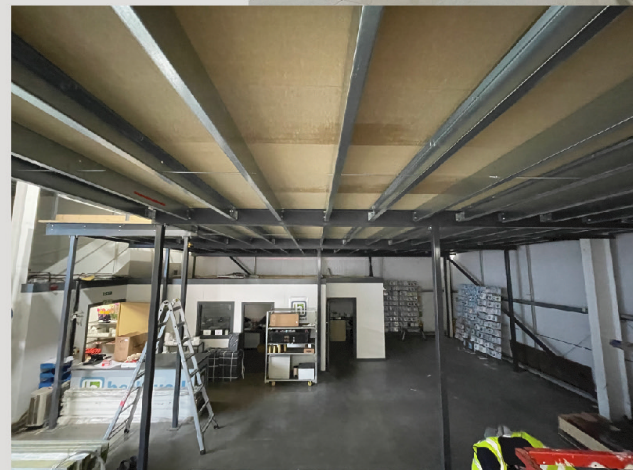
Mezzanine deck boards installed