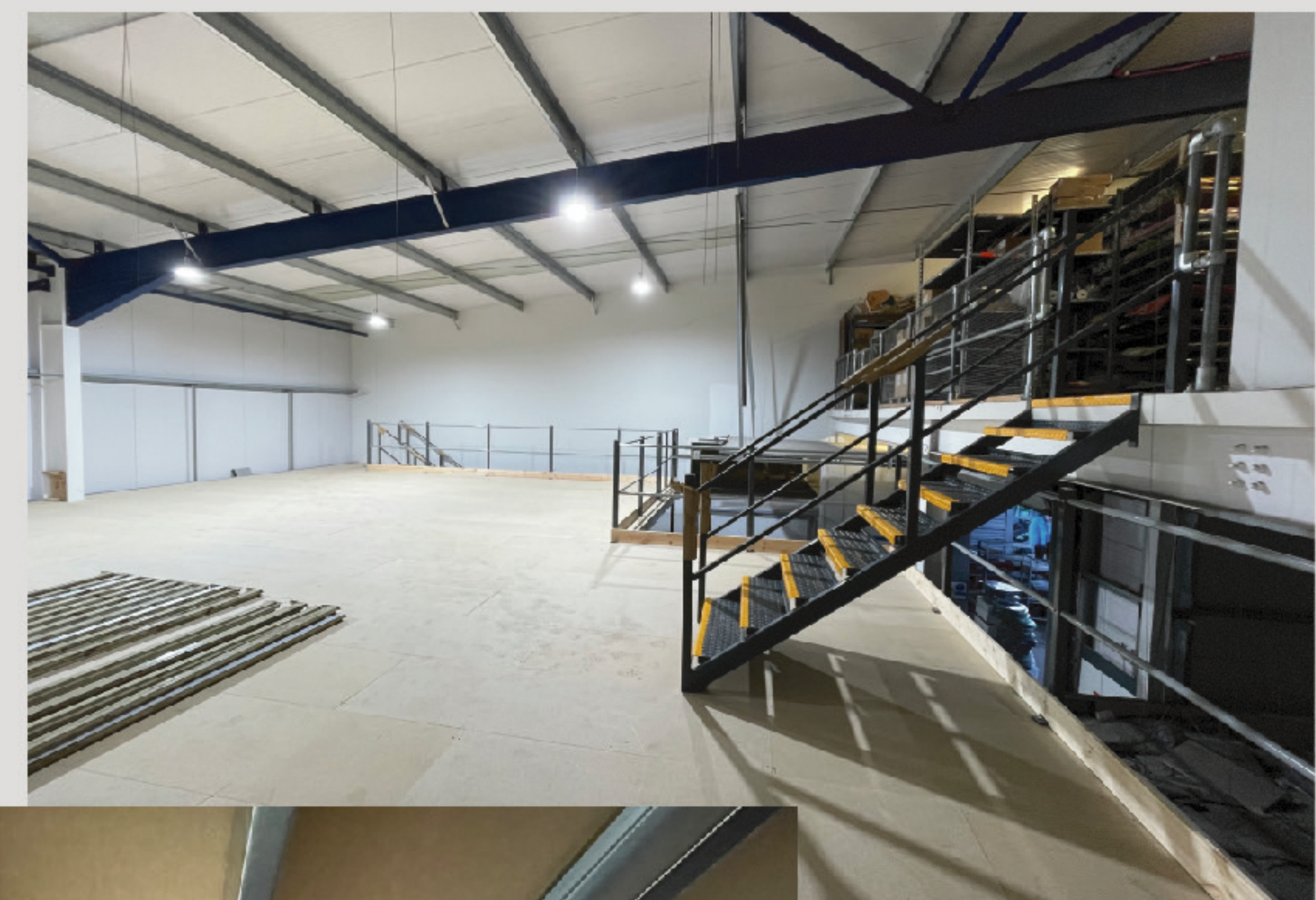
Production and installation of mezzanine floor

All works were completed in 6 days, gaining Helliwell Flowers an additional 130m 2 of workspace. Just in time for their peak season deadline!