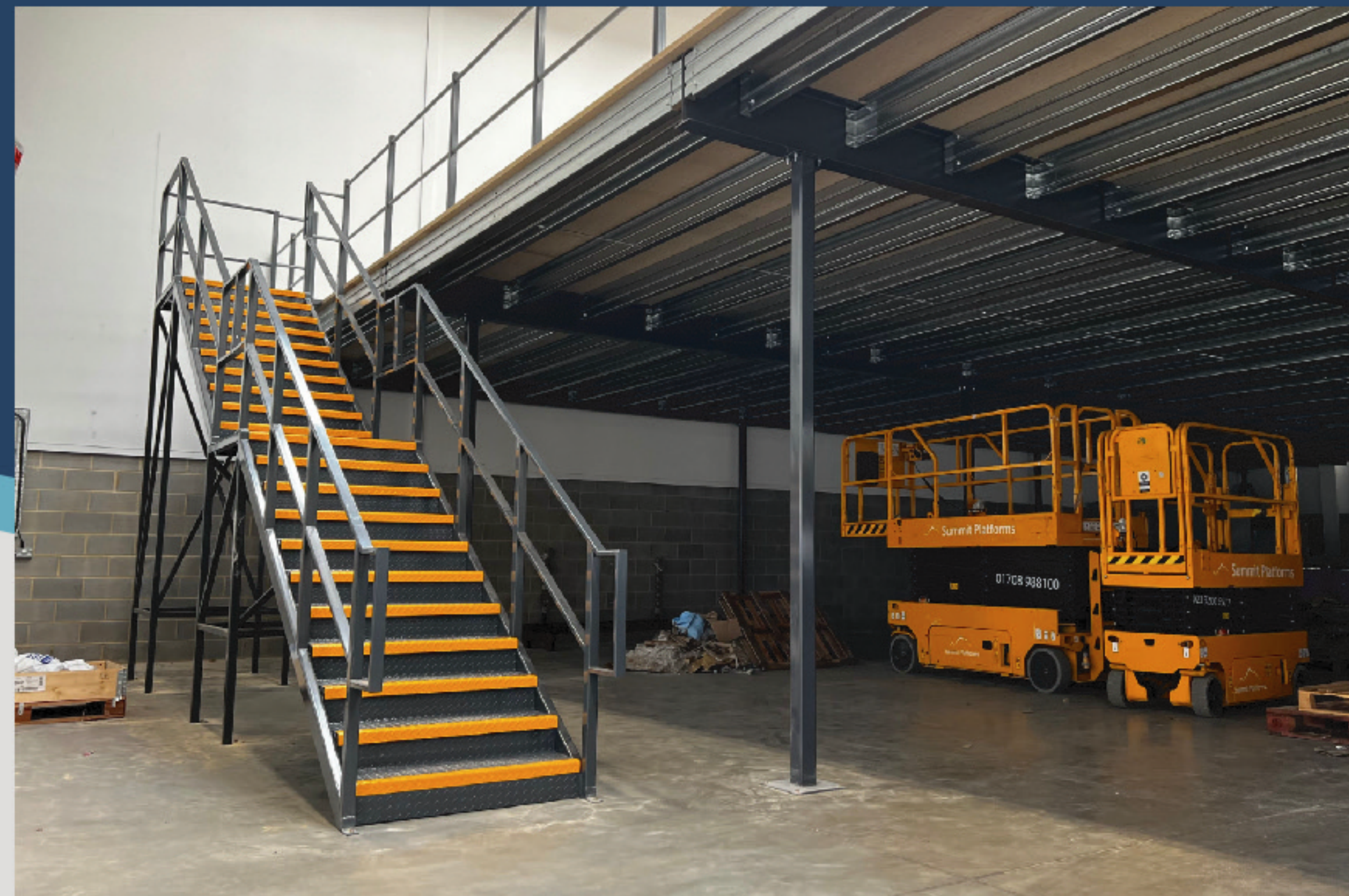
Mezzanine frame installation

Westwood Projects were engaged by Pelham Laboratories to design, manufacture, and install a 480m 2 mezzanine floor at their new manufacturing and production facility in Waterlooville. The mezzanine was installed to provide office space, with the underside being utilised as a production area.