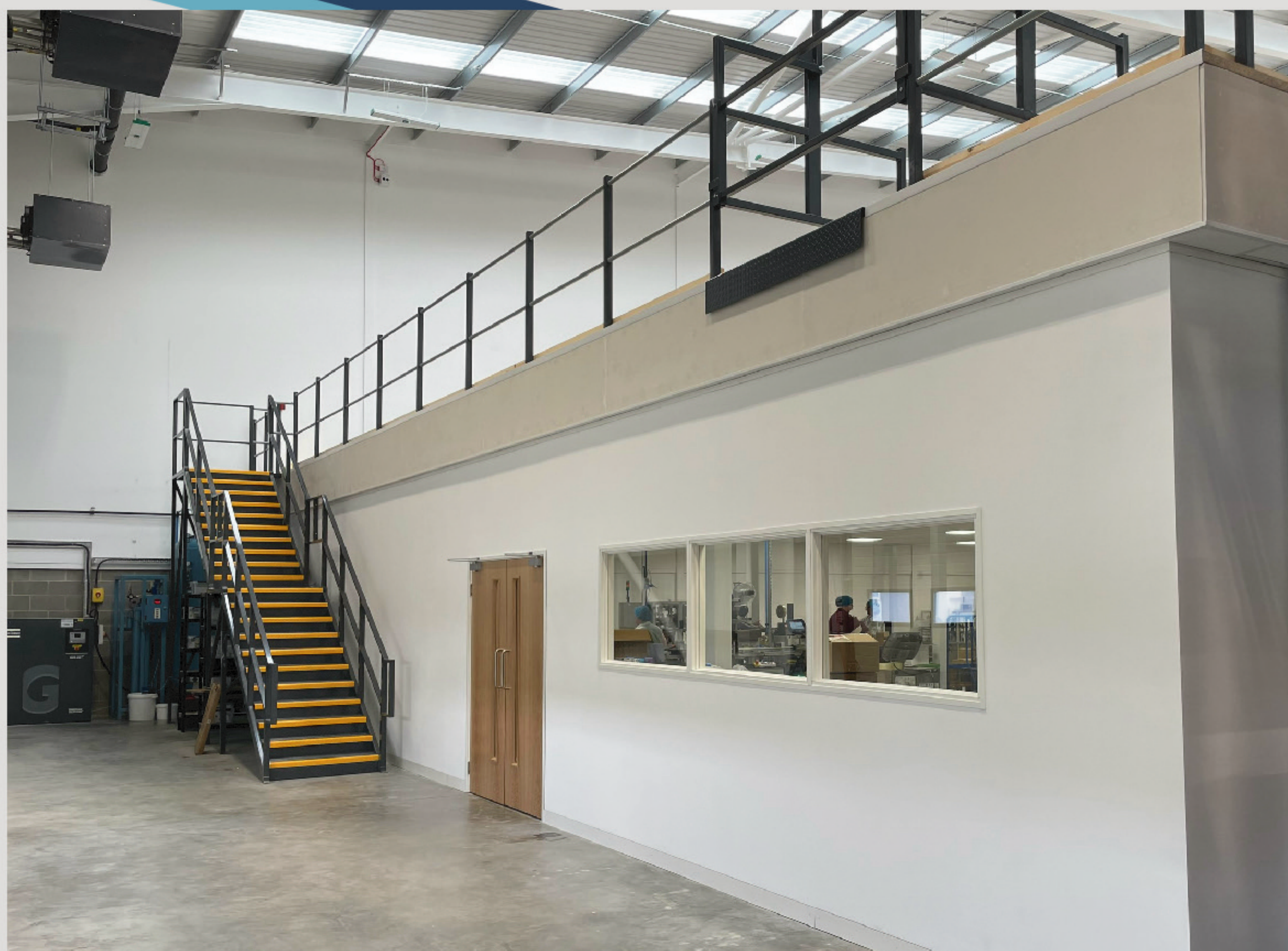
Completed mezzanine floor in use

"I can't recommend the Westwood Projects Team highly enough - approachable, professional and flexible when installing a large mezzanine, internal offices and a manufacturing space over 6m high. The quality of their work has been excellent"