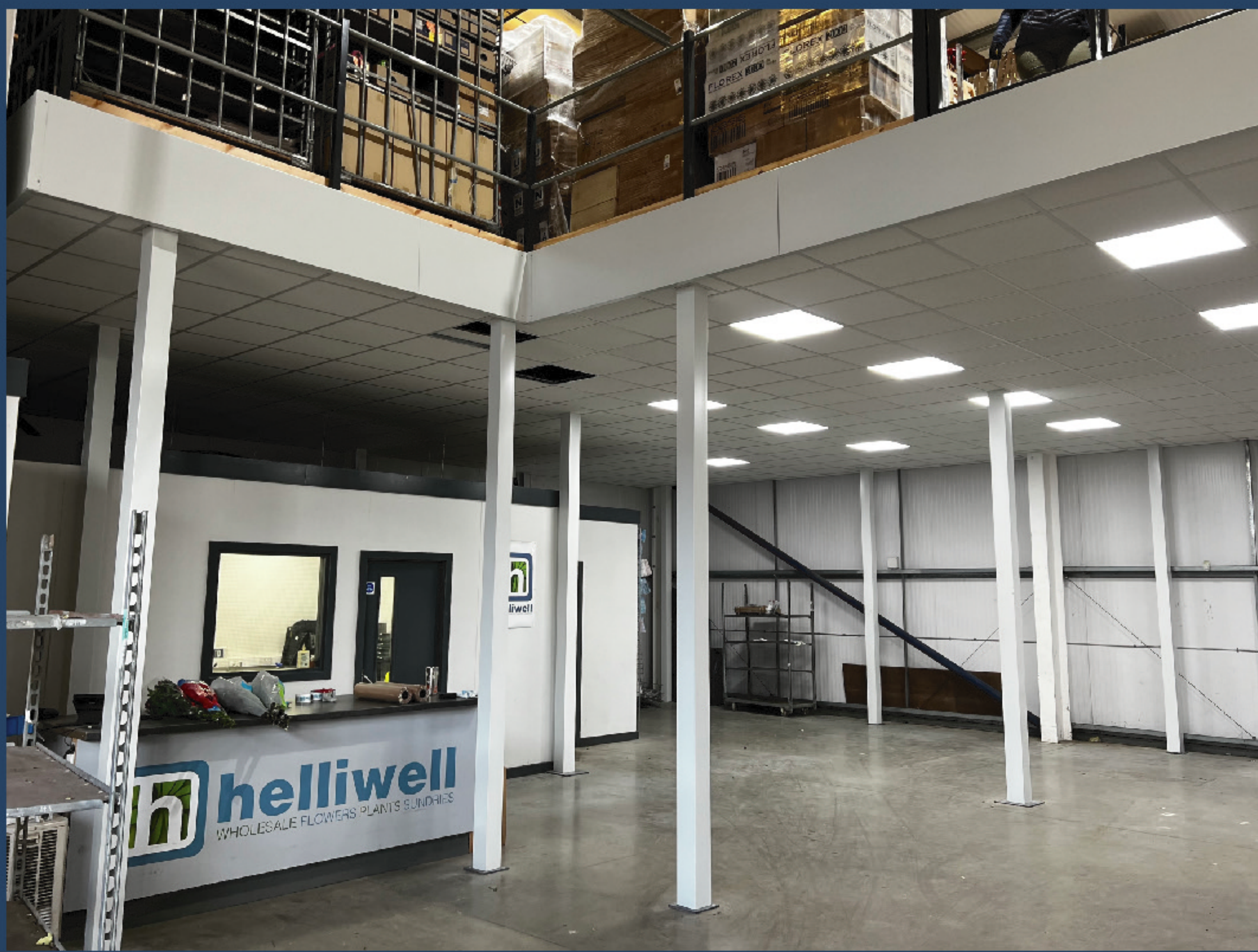
Completed mezzanine floor in use