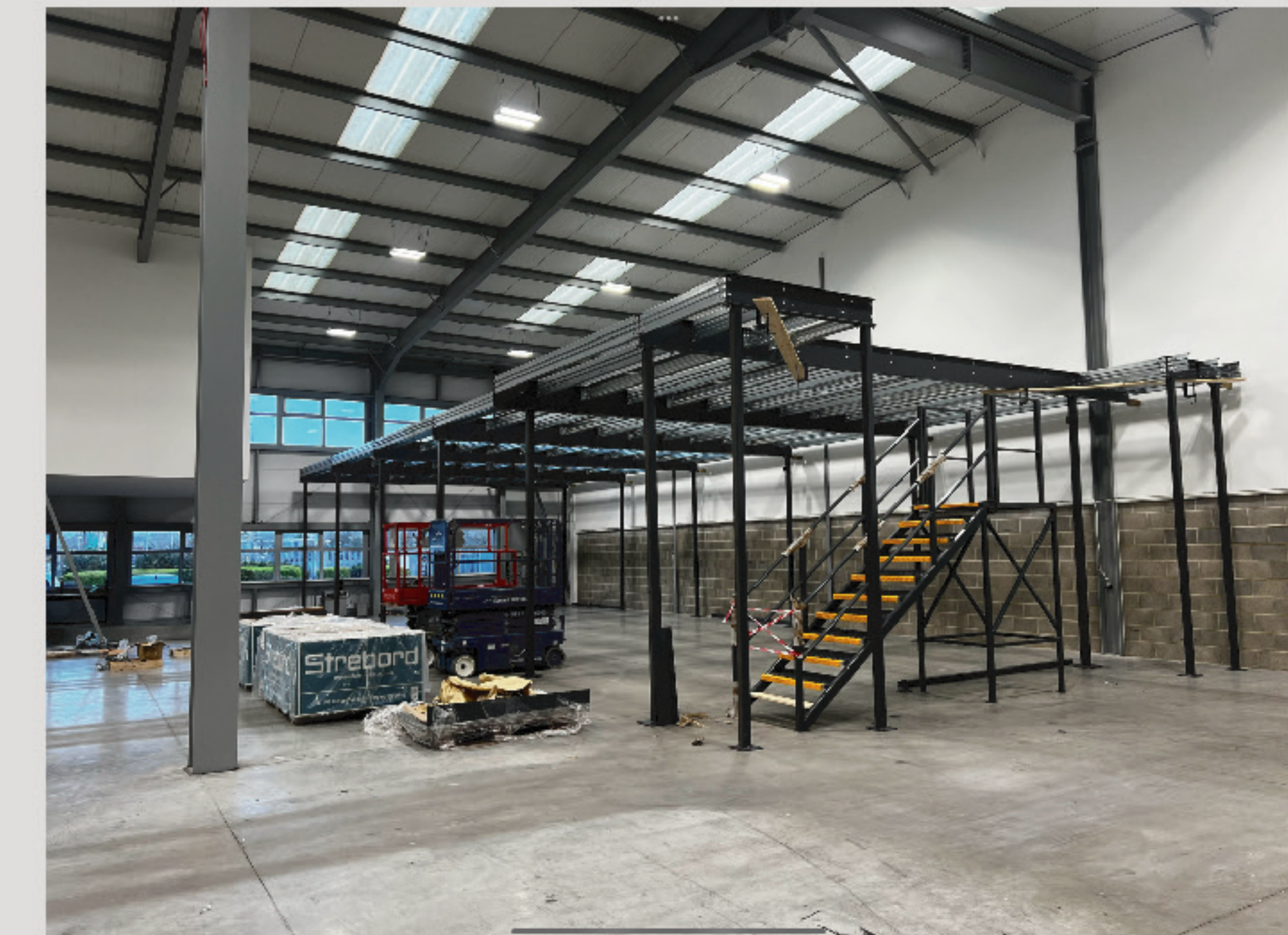
Production & Installation